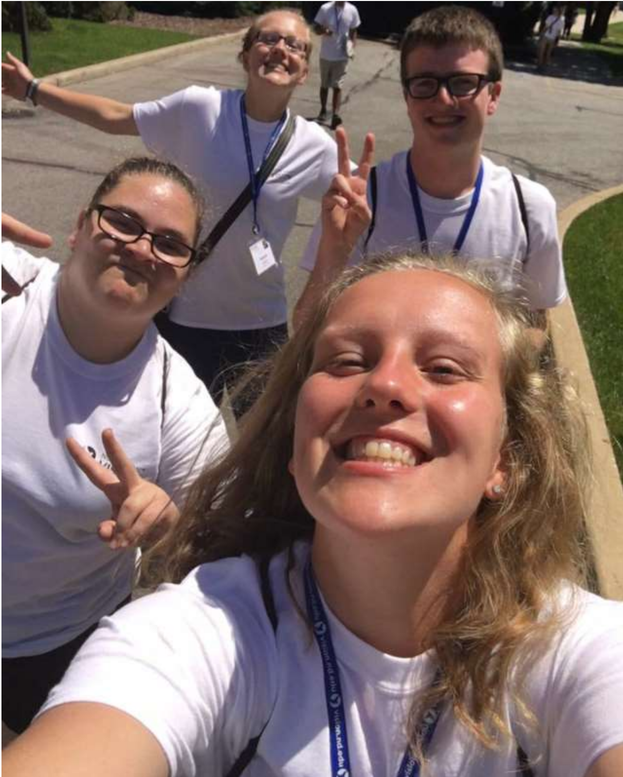
Sacred Heart's four youth at the end of the week.