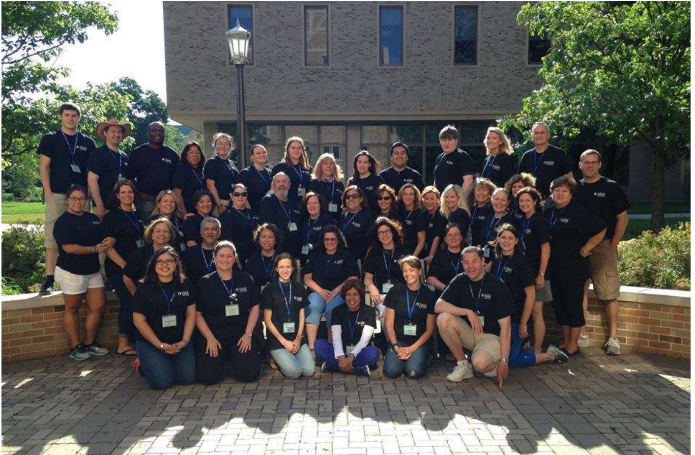
The Campus & Youth Ministers (Adults) at ND Vision week 1