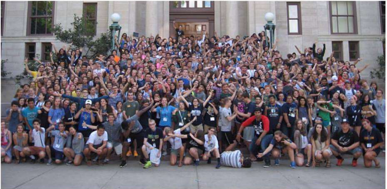
The youth at ND Vision – Week 1