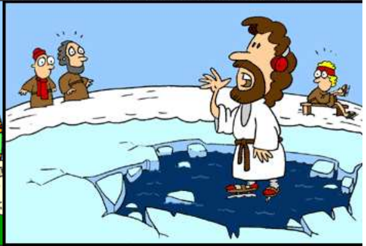
01-15-20(See Matthew 14:24-33)

I THINK YOU GUYS HAVE THE WRONG IDEA ABOUT THE ARK